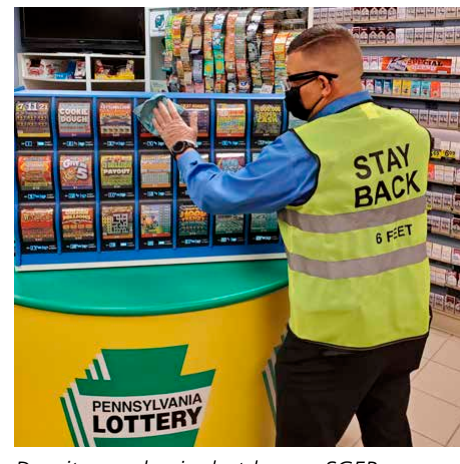
Despite pandemic shutdowns, SGEP ensured the supply chain to retailers remained open.

All ® notices signify marks registered in the United States. © 2020 Scientific Games Corporation. All Rights Reserved.