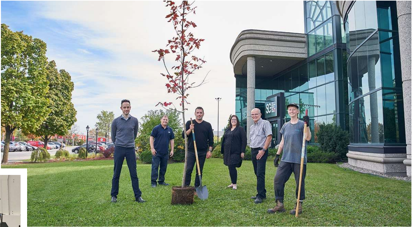
Tree planting in Montreal.